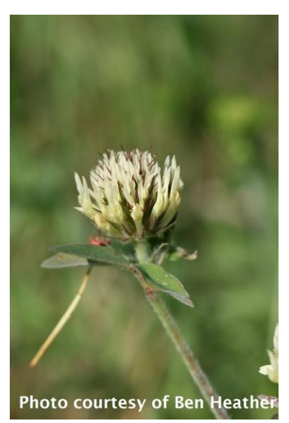
Sulphur clover can be found on this RNR.

As this is a MEDIUM RISK site you are advised NOT to visit this RNR. Volunteers are permitted to work on this RNR provided they take appropriate safety precautions